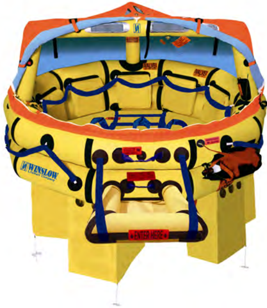
→ Front View Closed Canopy w/ Clear, Fixed View Ports