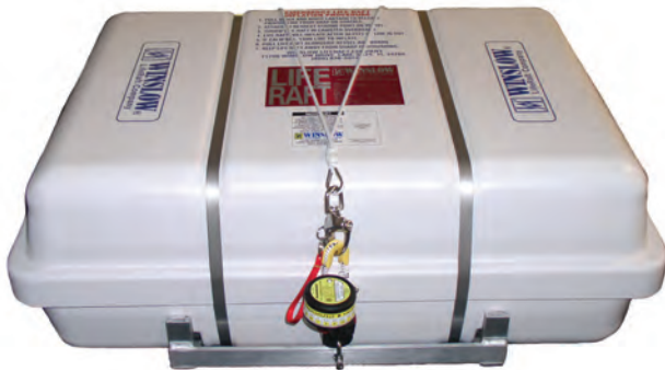
Low Profile Traditional Marine Canister, UV Inhibiting With Cradle & Hydrostatic Release As Shown Above: 25" x 34" x 14 1/2" Without Cradle: 25" x 34" x 12 1/2" With Cradle: 25" x 34" x 14 1/2"