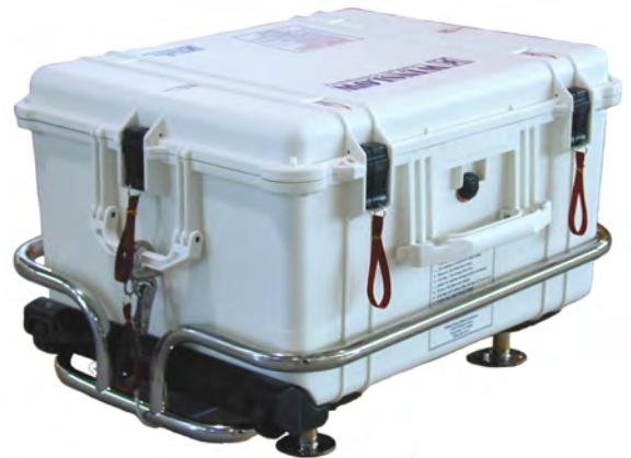
WINSLOW Pelican® Pac 4 or 6 Person Offshore With Cradle As Shown Above: 25" x 20 1/2" x 16 1/4" Without Cradle: 25" x 20" x 14"