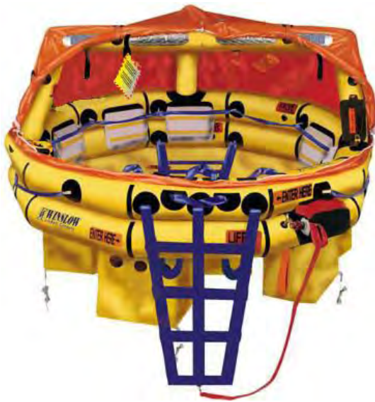
→ Front View Closed Canopy