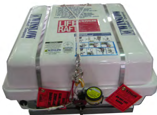
Low Profile Traditional Marine Canister, UV Inhibiting With Cradle & Hydrostatic Release As Shown Above: 25" x 25.5" x 14 1/2" Without Cradle: 25" x 25.5" x 12 1/2" With Cradle: 25" x 25.5" x 14 1/2"