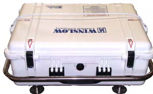
WINSLOW Pelican® Pac 4 or 6 Person Ultra Light Offshore With Cradle As Shown Above: 25 1/2" x 22" x 10 1/2" Without Cradle: 23 1/4" x 19 3/4" x 9"