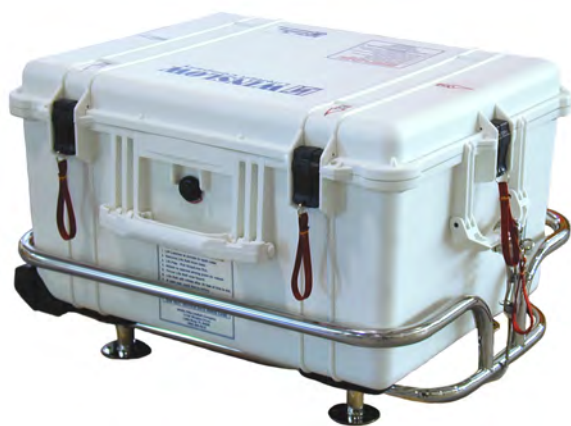
WINSLOW Pelican® Pac 8 Person Ultra Light Offshore With Cradle As Shown Above: 25" x 20 1/2" x 16 1/4" Without Cradle: 25" x 20" x 14"